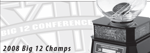
2008 Big 12 Champs

Illinois State dropped a 194.100-192.325 decision to in-state foe Illinois-Chicago on Feb. 28. The Redbirds picked up their lone event title with a 48.425-48.175 win on beam.